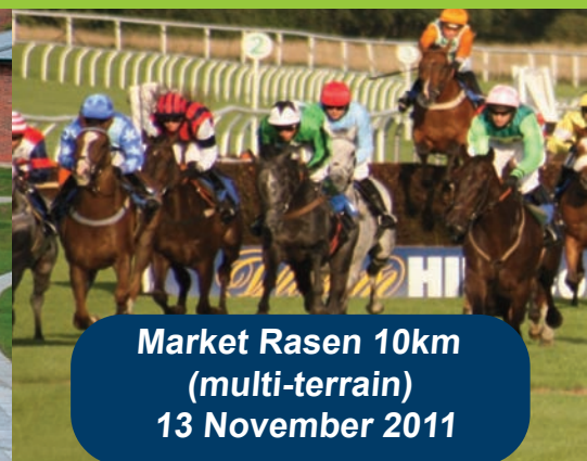
Market Rasen 10km (multi-terrain) 13 November 2011